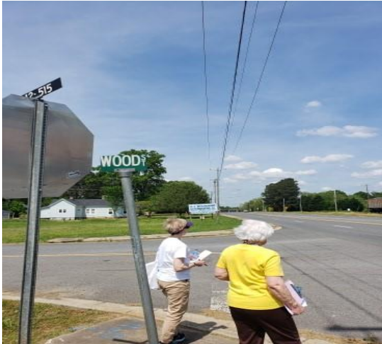
Wood St. and Hwy 9