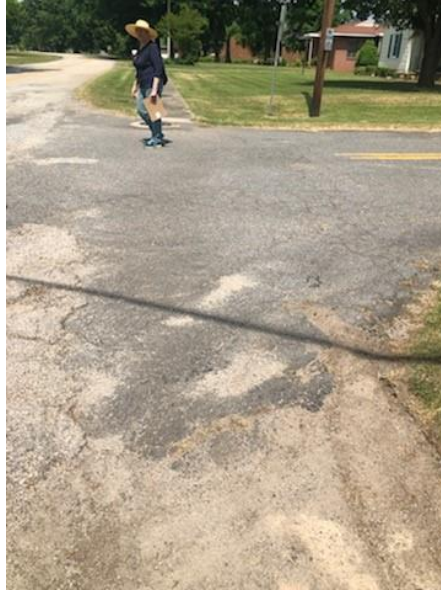
No crosswalk at Corner of Main and Church Street