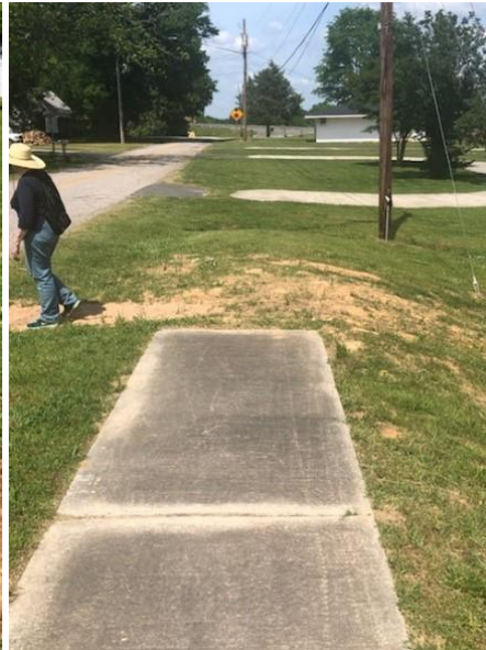
(before the Wagon Wheel restaurant)