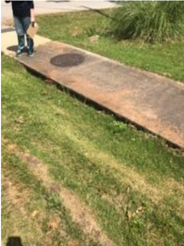
Corner of Main and Oak