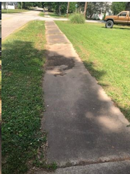
In front of Rowell House: Cracks in sidewalks/Dip in sidewalk and incline