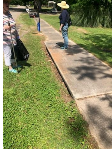
5586 Main St. – uneven sidewalk and drain with drop off