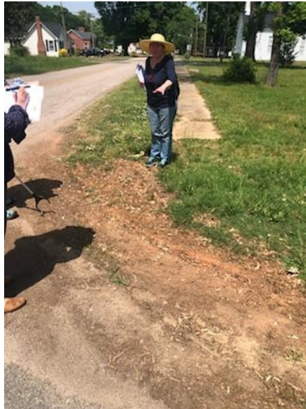
Sidewalk ends abruptly

Cracked or uneven walking surfaces and sidewalks create tripping hazards for pedestrians and restricts rolling for walkers/wheelchairs.