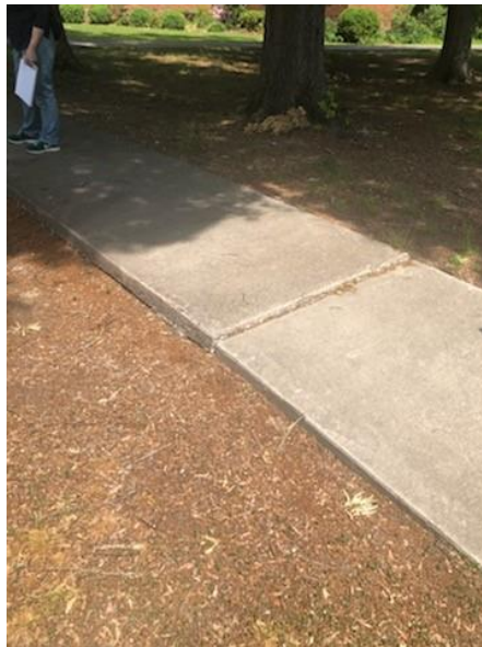
5608 Main St. – uneven sidewalk, not level with grass