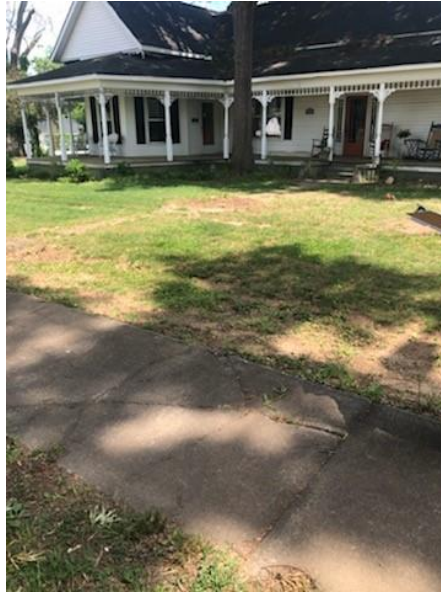
Corner of Main and Church St. – no ADA-compliant curb