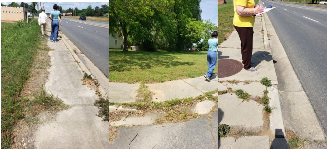
Hwy 9 - from Southern Roots (hair salon) all the way to Marathon Gas Station (Sidewalk needs to be cleaned of grass and fire ants)

Areas of cracked/uneven sidewalk (at Holiday Hotel and at Elm Ave)