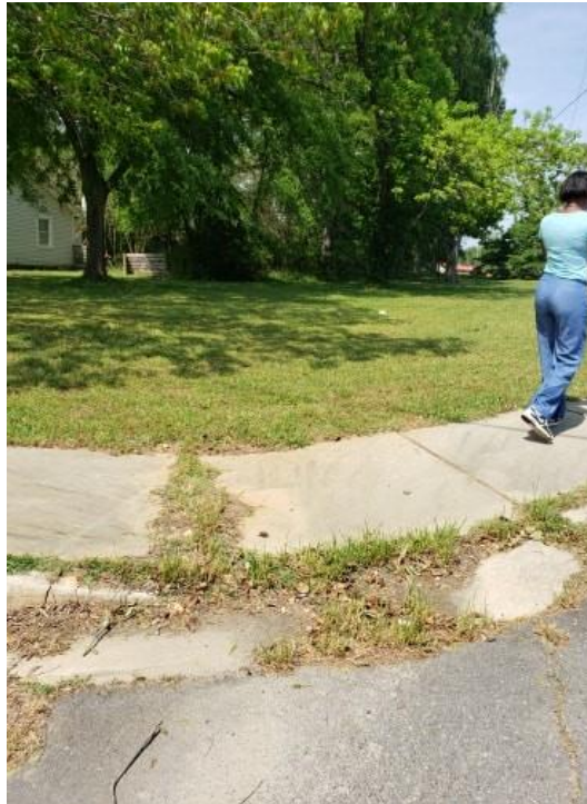
The sidewalk along Hwy 9 – ALL crossings need ADA-compliant curb ramp with DWS