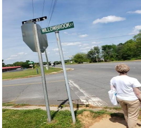
Willowbrook St. and Hwy 9

Additional crosswalks needed at similar crossings at: