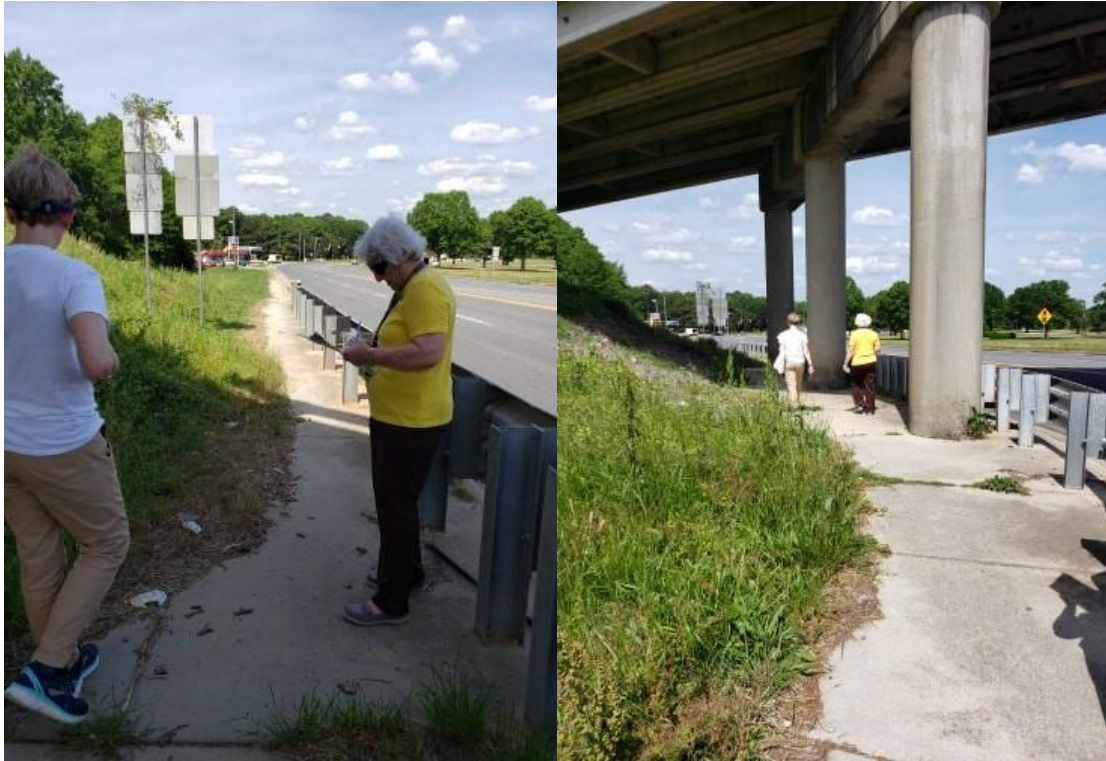
Underpass at Hwy 9 & 21 – grass has grown onto the sidewalk making it difficult for pedestrians (walking or wheeled) to pass through. The sidewalk narrows due to the overgrown grass, making it difficult for all pedestrians to access.