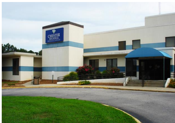
MUSC Health - Chester Medical Center

For more information or to find out about partnership opportunities, please contact us.