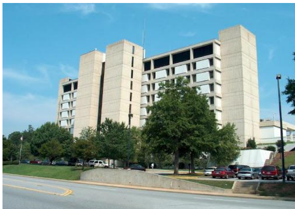
MUSC Health - Lancaster Medical Center